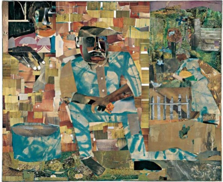
The ART OF ROMARE BEARDEN

Teacher Packets include a printed booklet with in-depth background information, suggestions for student activities, supplemental image CDs, and often with color study prints, timelines, and bibliographies.