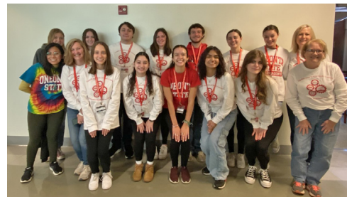
Fall 2022 SUNY Instructors and Volunteers